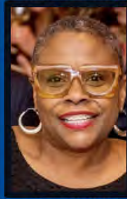
Class of 1986

As King and Queen contestants of the National Alumni Association SAU 2022 Competition, you have worked diligently to raise scholarship funds for Saint Augustine's University students.