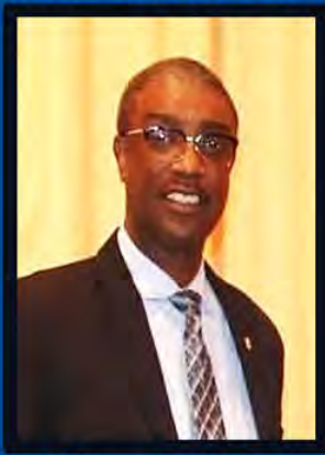
Class of 1978